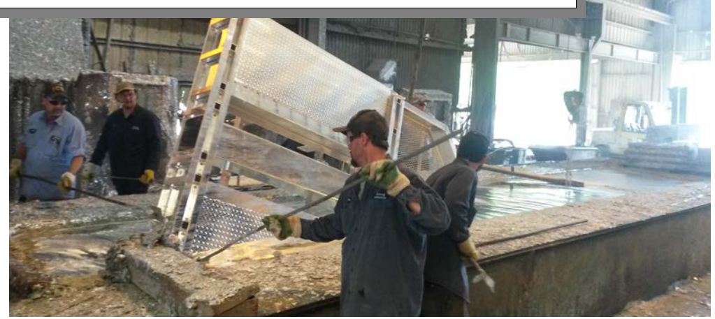
As it is removed, workers skim floating dross out of the way.