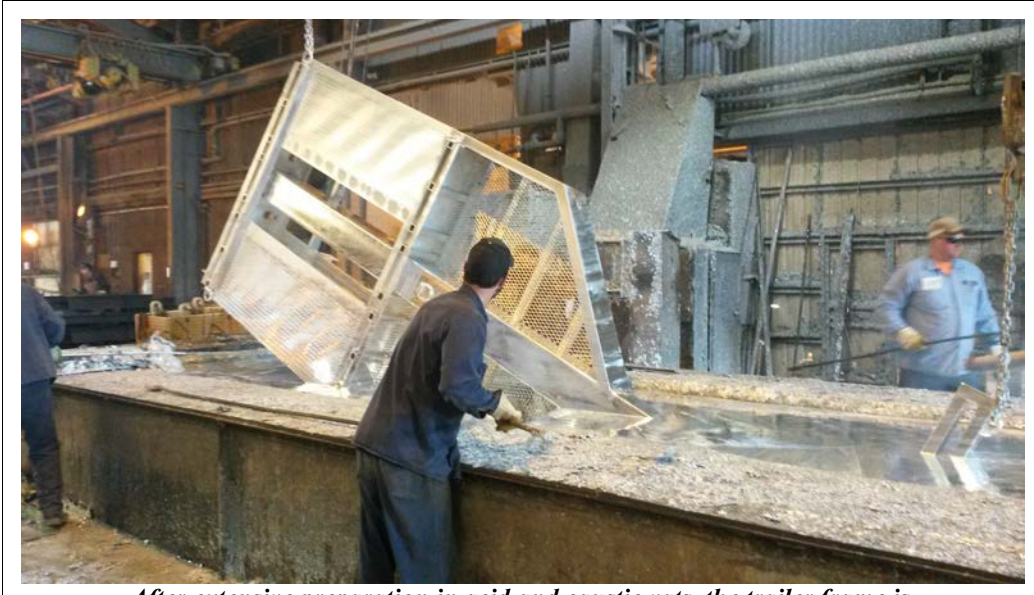
After extensive preparation in acid and caustic vats, the trailer frame is dipped in a kettle full of 800 degree zinc.