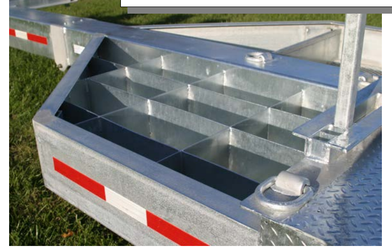
Hot dip galvanizing covers where it is hard to reach with a paint gun.

trailer will fad to a dull but uniform grayish color, much like the grain bin in the background of this photo. The dull color is actually the protective film that forms on the surface.