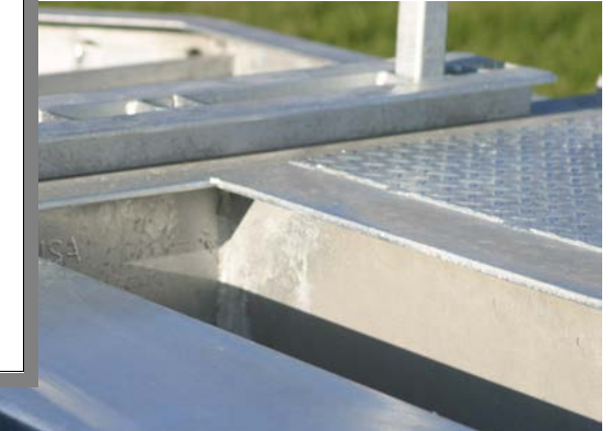
Hot dip galvanizing produces a very durable finish, but the nature of the process makes it difficult to get a totally smooth surface when there are edges and inside corners.