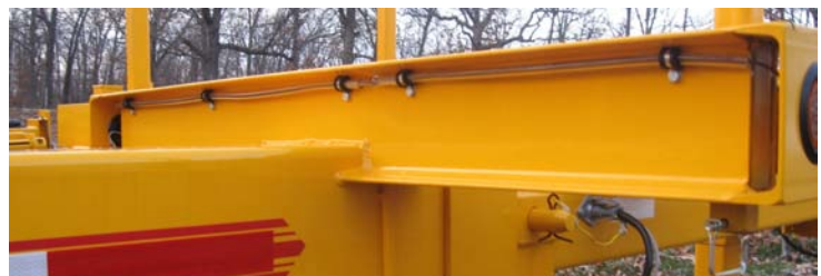
Clear PVC loom protects wiring and allows for easy inspection.