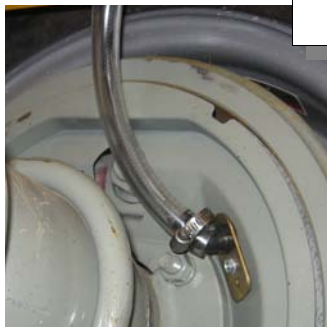
Brake wires are protected.