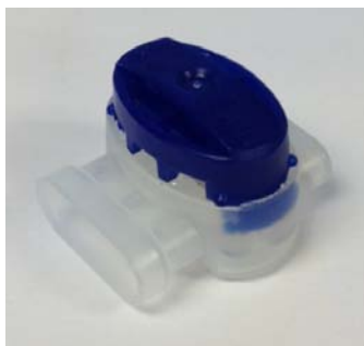
3M 314 Connector

In our 35 years of industrial trailer manufacturing experience we have found no better wire connecting system than the marine grade 3M Model 314 connector.