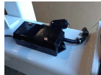
Front Junction Box

The back is transparent, allowing the installer to verify correct wire placement.